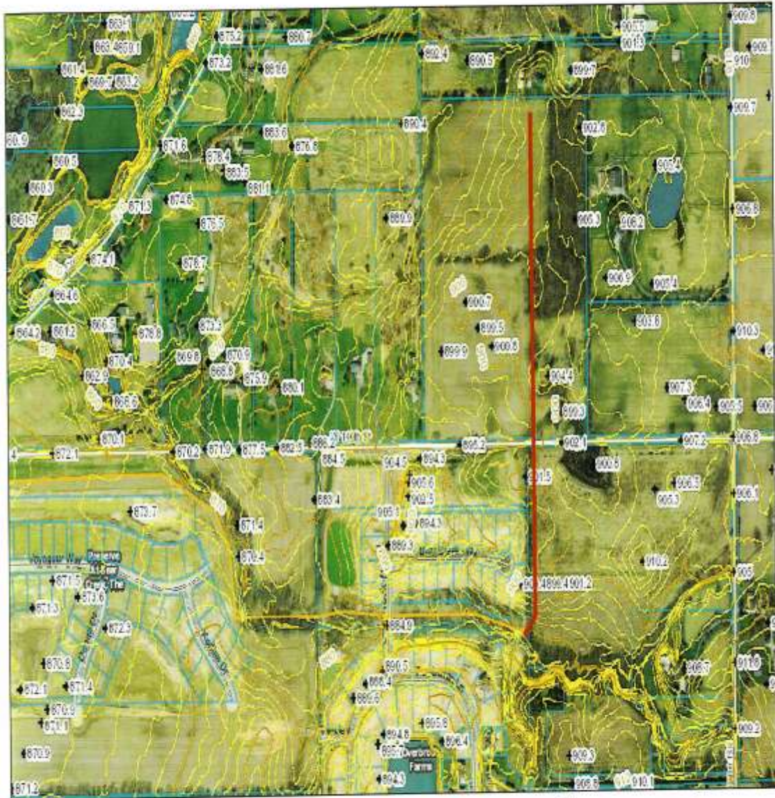
Hamilton County Map