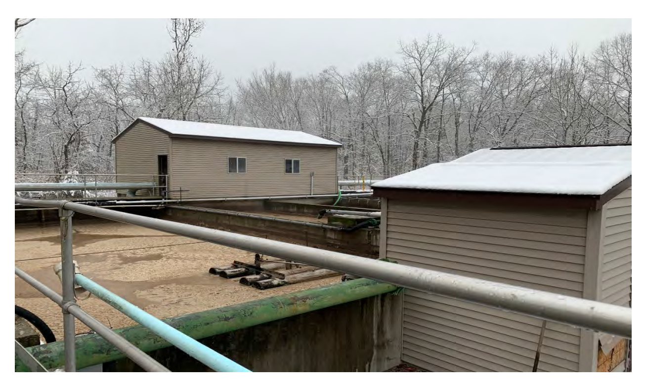
Sequence Batch Reactor Tanks Photo 2