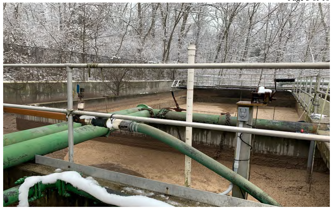
Sequence Batch Reactor Tanks Photo 1