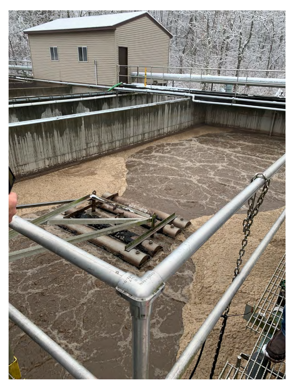
Sequence Batch Reactor Tanks Photo 3