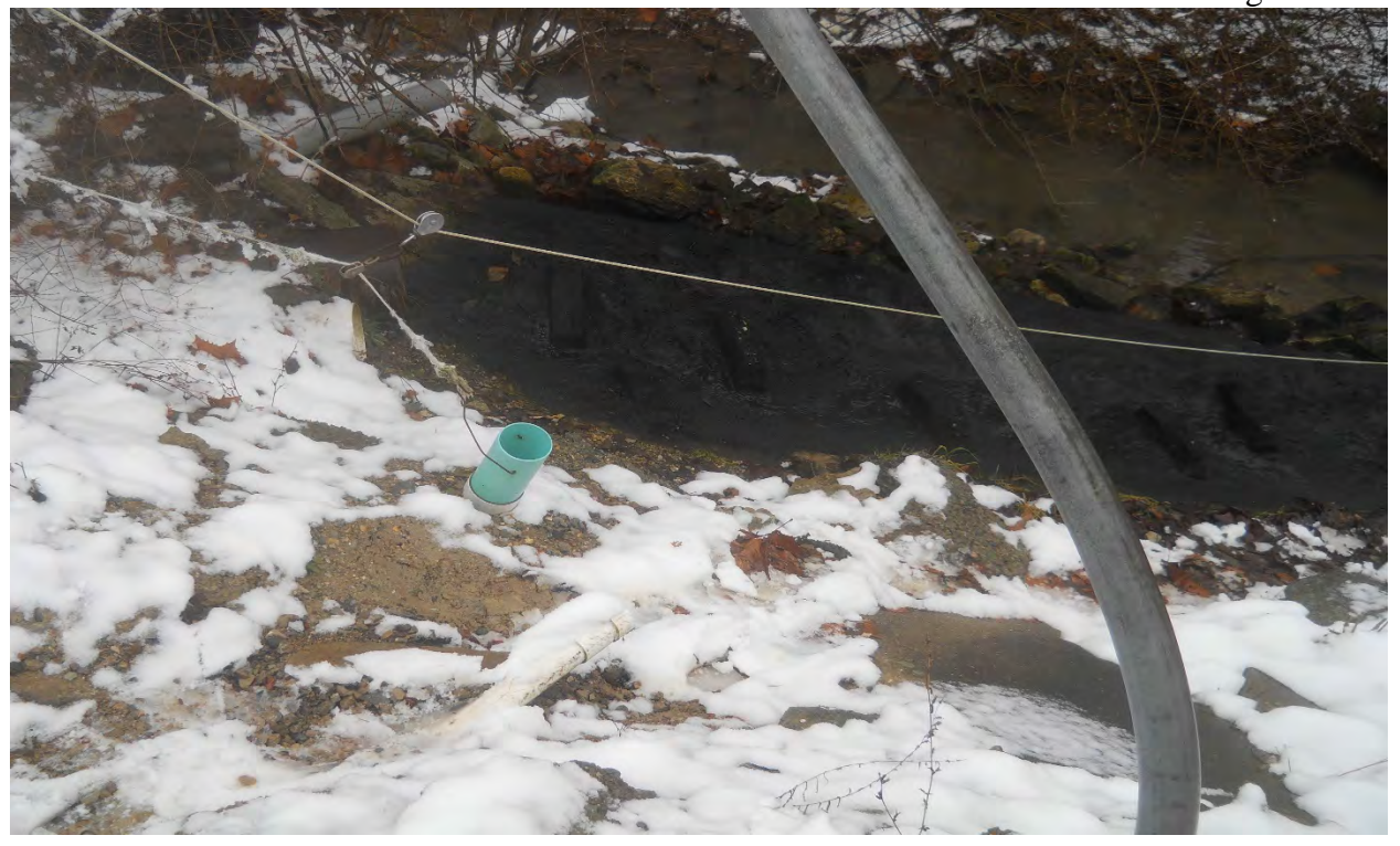
Plant Outlet Photo 1

OUCC Attachment JTP-1 Cause No. 45307-U Page 9 of 10