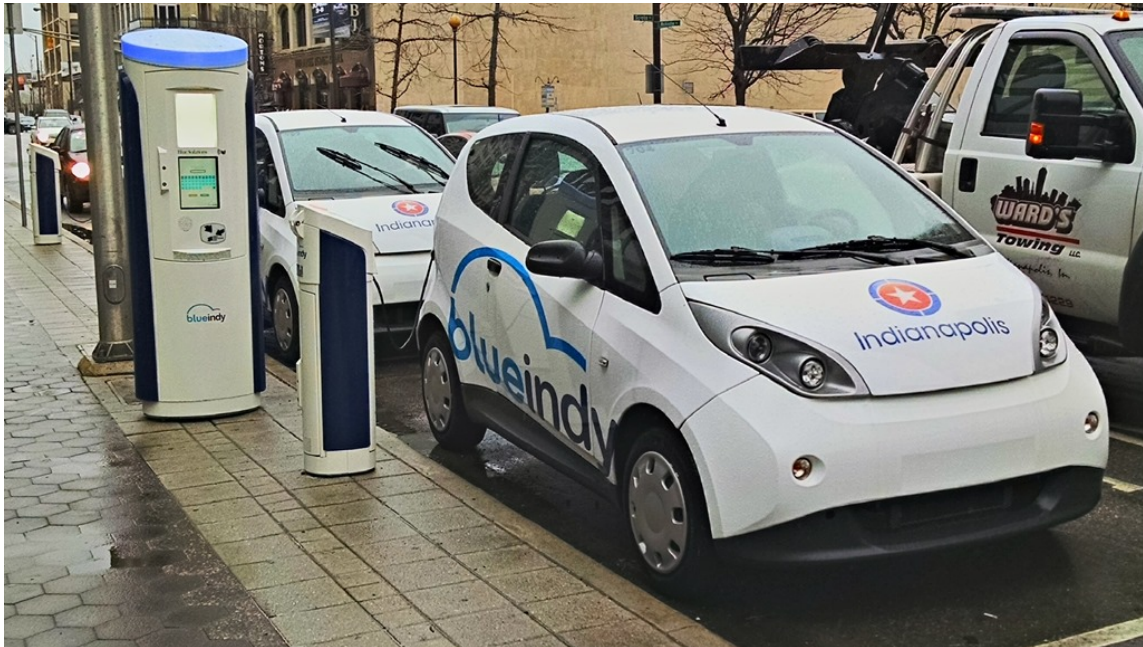
BlueIndy Enrollment Kiosk downtown Indianapolis. (Typically 1 per location, at select locations only)

BlueIndy Station downtown Indianapolis showing Bluecars, Reservation Kiosk and Meter Pedestal.