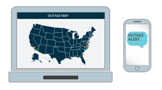
about outages and restoration times.