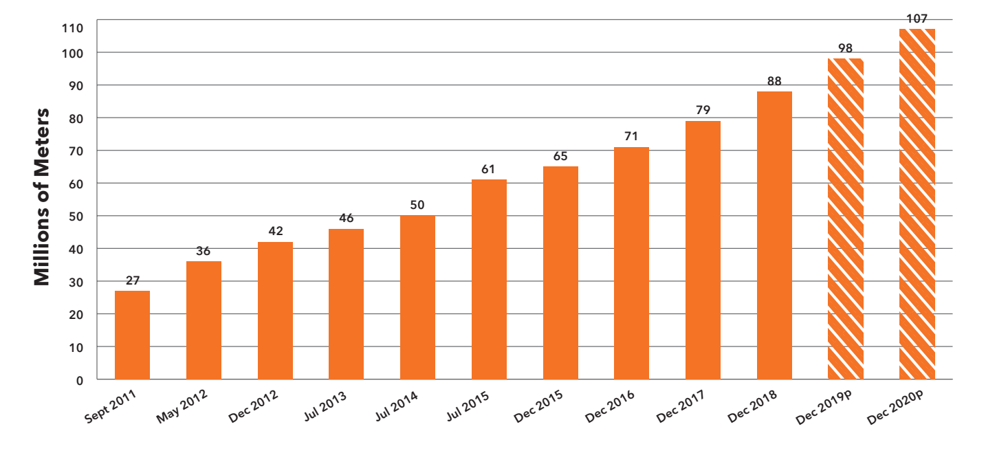
Figure 1: U.S. Smart Meter Installations Approach 98 Million; Projected to Reach 107 Million by December 2020

As shown in Figure 1, smart meter installations have grown dramatically since 2011. As of yearend 2018, electric companies had installed more than 88 million smart meters, covering nearly 70 percent of U.S. households. Based on survey results and approved plans, estimated deployments are expected to reach 98 million smart meters by the end of 2019 and 107 million by year-end 2020.